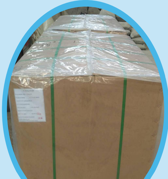
★ ★ 3 ★ ★