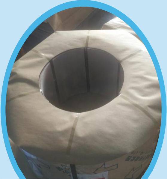
★ ★ 2 ★ ★