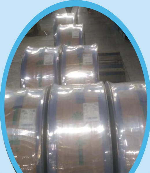
★ ★ 1 ★ ★